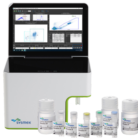
CyFlow Cube 6 V2m with CyFlow BrettCount reagent kit